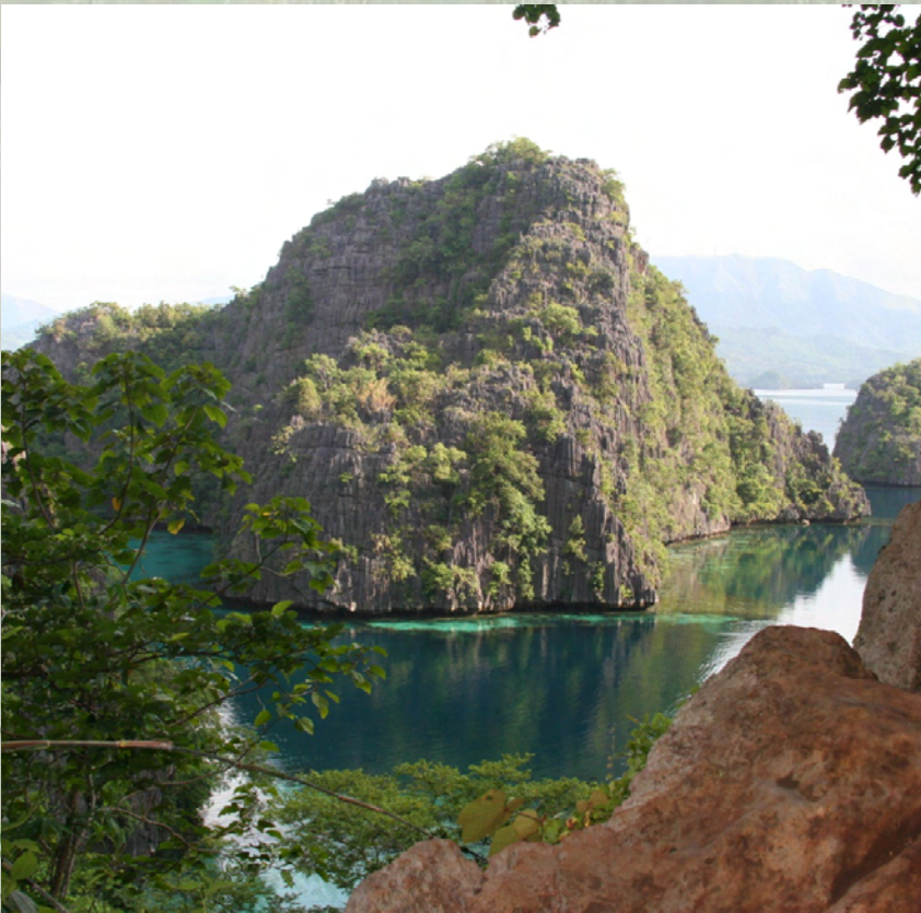
Sacred Lakes & Watershed areas