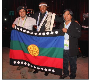
ICCAS: KEY ELEMENTS IN THE REFLECTION ON GOVERNANCE OF PROTECTED AREAS