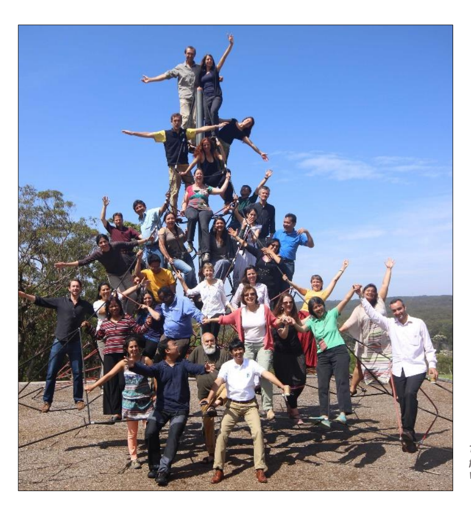
The participants in the Post WPC field visit and capacity exchange in Wollongong