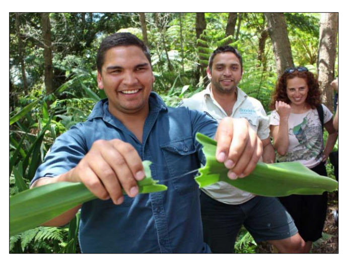
Field visit at Booderee National Park

Forty participants gathered again, after the end of WPC, and left together for a field visit to the Country of the Dharawal, Durga and Wollongong Nations, south of Sydney. They took time to relax, walk, admire the country and enjoy each other's company... but they also did some pretty intense work, "exchanging capacities" and belabouring together the concept and possible practical application of Regional Learning Networks on governance of protected (and conserved) areas in different world regions. The <u>full list of participants and their affiliations is available here</u>.