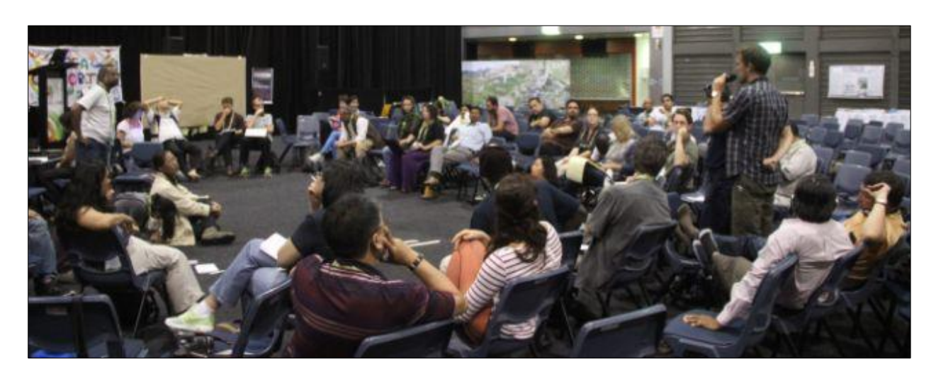
2nd part of the General Assembly