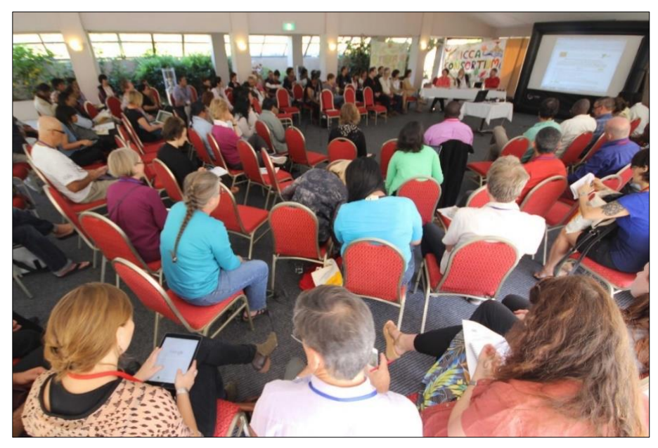
The 2014 General Assembly of the ICCA Consortium – Part I in the Blue Mountains

the Consortium in particular". The GΑ allowed sharing the strategic outlook of the Consortium, Membership report, the Preliminary Financial Report for 2014, and ideas from the Chair of the Statutes Committee and the Communication Assistant. However, there was not enough time to review the details of the work plan for 2015 as