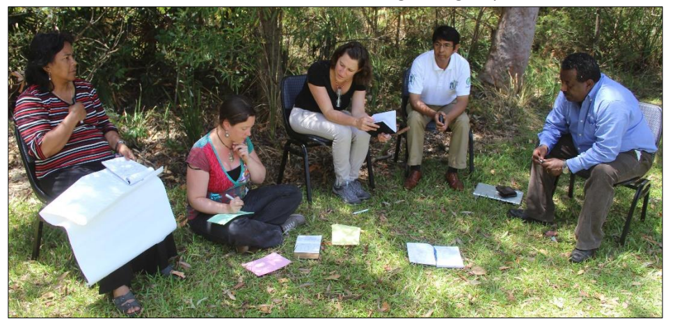
The working group on Africa discussing options of Regional Learning Networks in the continent

The final aim of the event was to start discussing a number of Regional Learning Networks on governance of protected and conserved areas that could emerge under the auspices of the ICCA Global Support Initiative, an UNDP-GEF SGP initiative expected to take off in January 2015 with key partners including the ICCA Consortium, IUCN and UNEP WCMC. Regional groups were formed and discussions went on to