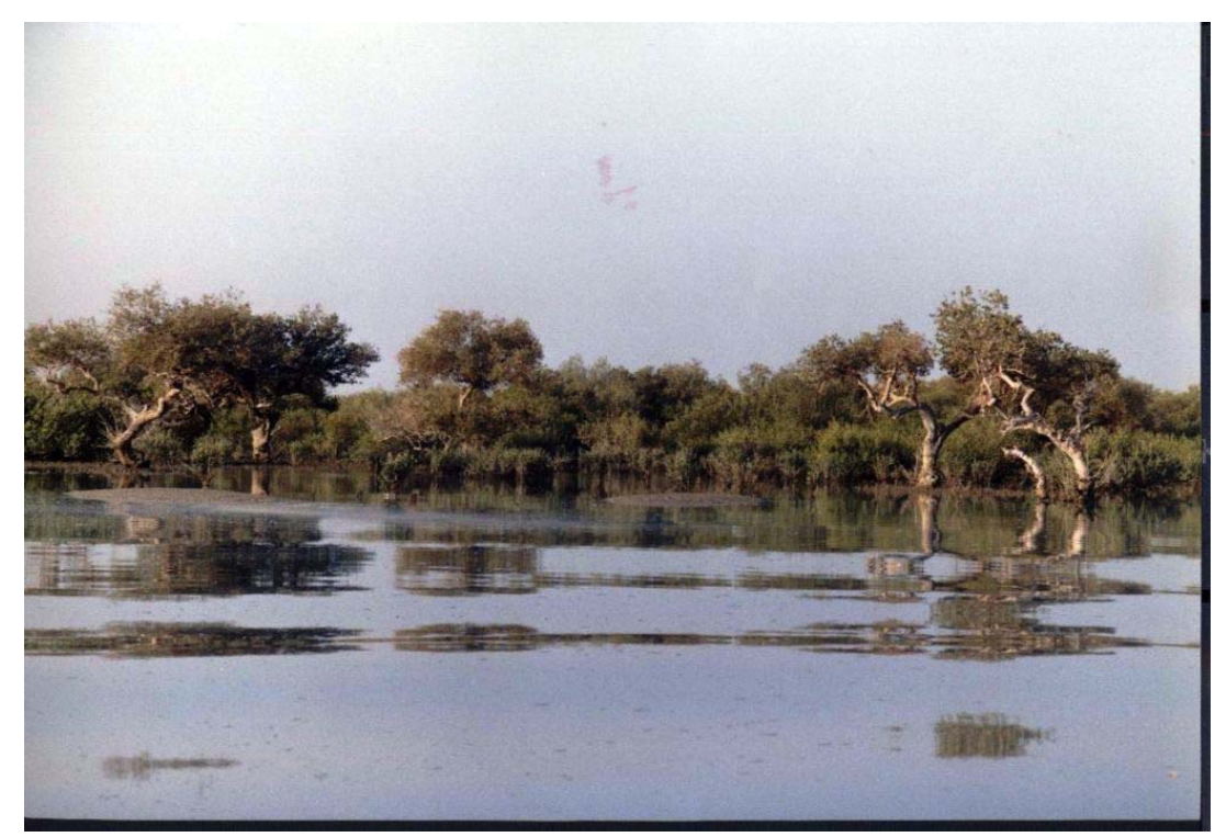
Fig.3 – Mangroves of Qeshm Island (northwest) are one of the areas where still tradtional fishing is practiced