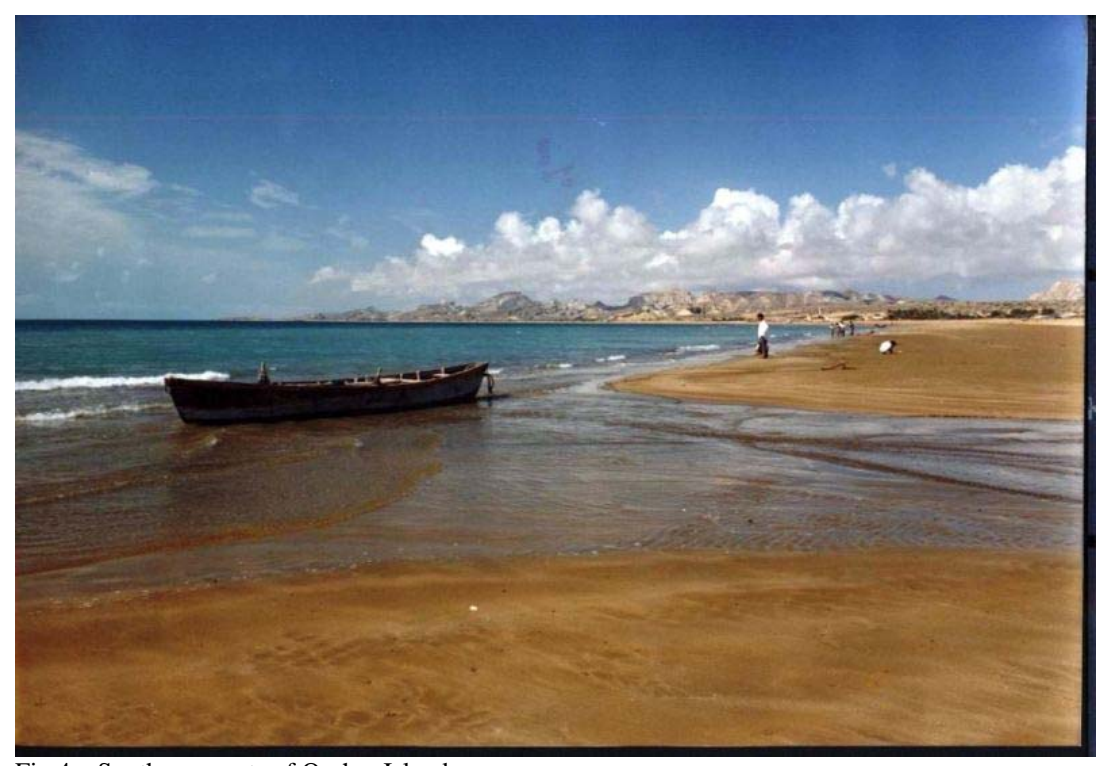
\overline{Fig.4}-Southern\ coasts\ of\ Qeshm\ Island