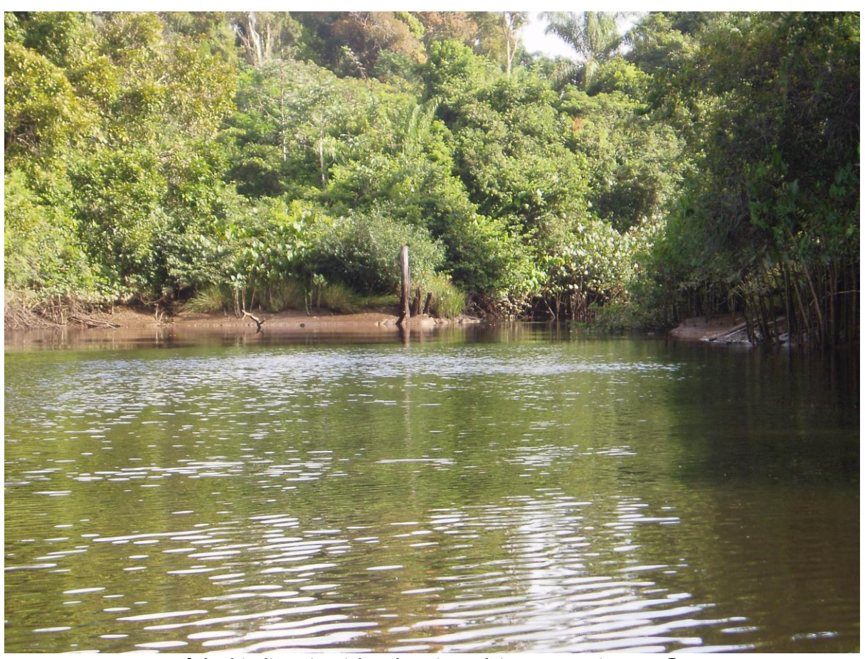
Part of the biodiversity rich Kaboeri Creek in West Suriname.

It is again recommended that indigenous peoples' rights are formally recognized in Suriname, and that environment NGOs support this crucial goal instead of holding on to outdated exclusionary policies for nature conservation.