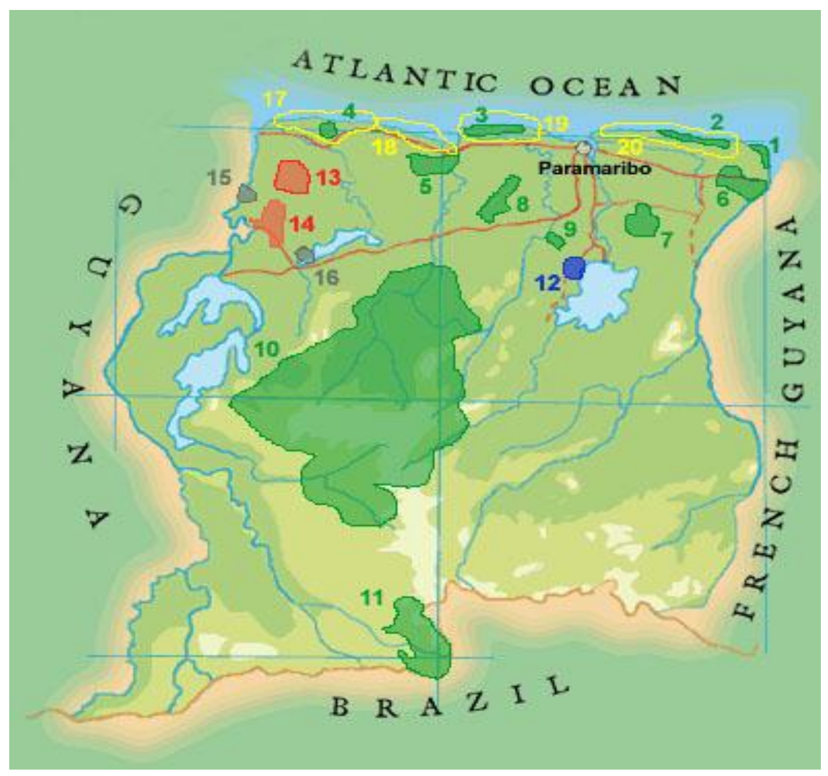
Map of protected areas in Suriname.

region as nature reserve (NR) is the presence in that region of diverse nature and landscapes and/or the occurrence of scientifically or culturally important flora, fauna and geological objects (article 2). The law does not give a definition of what a protected area or nature reserve is, nor of other areas that are also considered forms of protected area, namely 'nature park' and 'multiple use management area' (MUMA). Such areas are also designated by Government Resolution, based on the same Nature Protection Law (LBB/NB 2004).