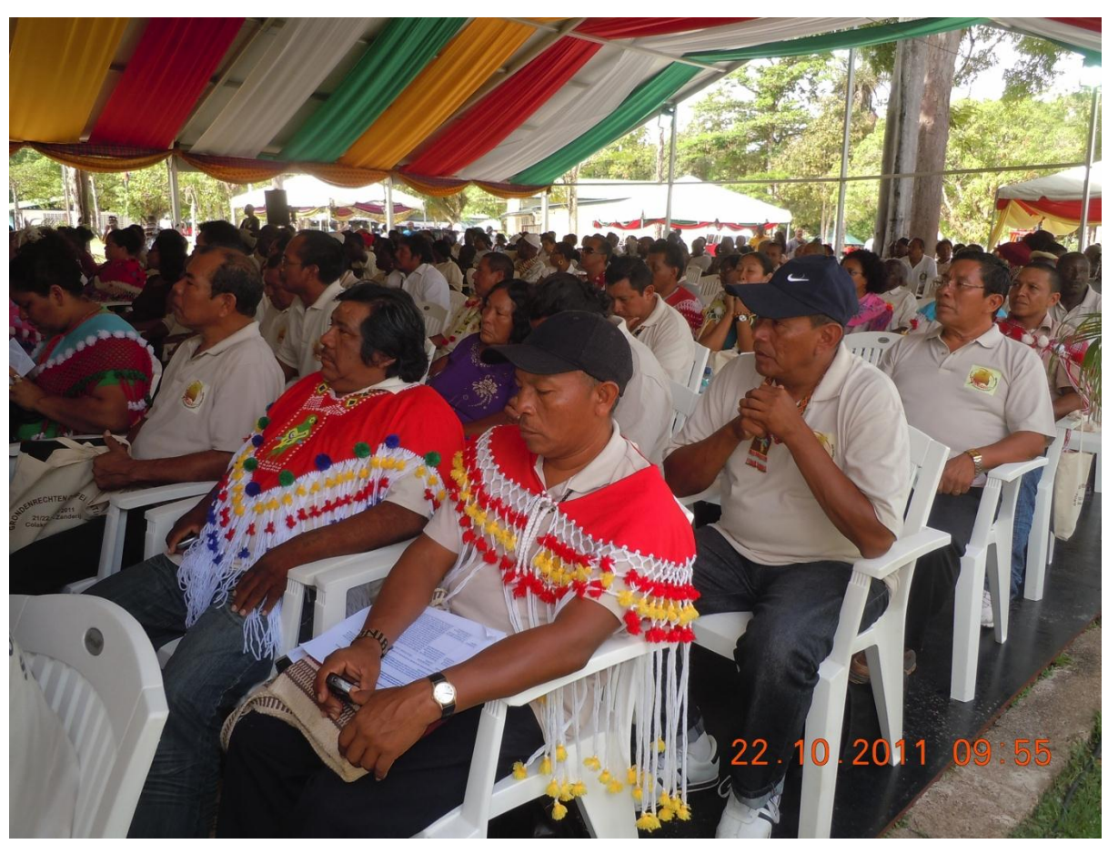
Indigenous leaders during the land rights conference organized by the government in October 2011.

decision-taking and the multiple incidences of new concessions being given in indigenous lands. This was done through numerous letters to the relevant ministers, formal petitions to the President in accordance with article 22 of the Constitution, lobbying and advocacy, and many press releases, interviews and other publicity articles. Since the early 2000's the attention of the UN-CERD has been requested for the persistent and pervasive racial discrimination against indigenous and tribal Peoples in the Suriname, and since 2006 the path to the regional Inter-American Commission on Human Rights and the Inter-American Court of Human Rights has been taken, where two cases have been filed. Various reports on the sustainable lifestyle and management of indigenous peoples' territories and resources have been published by VIDS, as well as experiences related to participatory and FPIC processes in relation to, among others, mining and forestry.