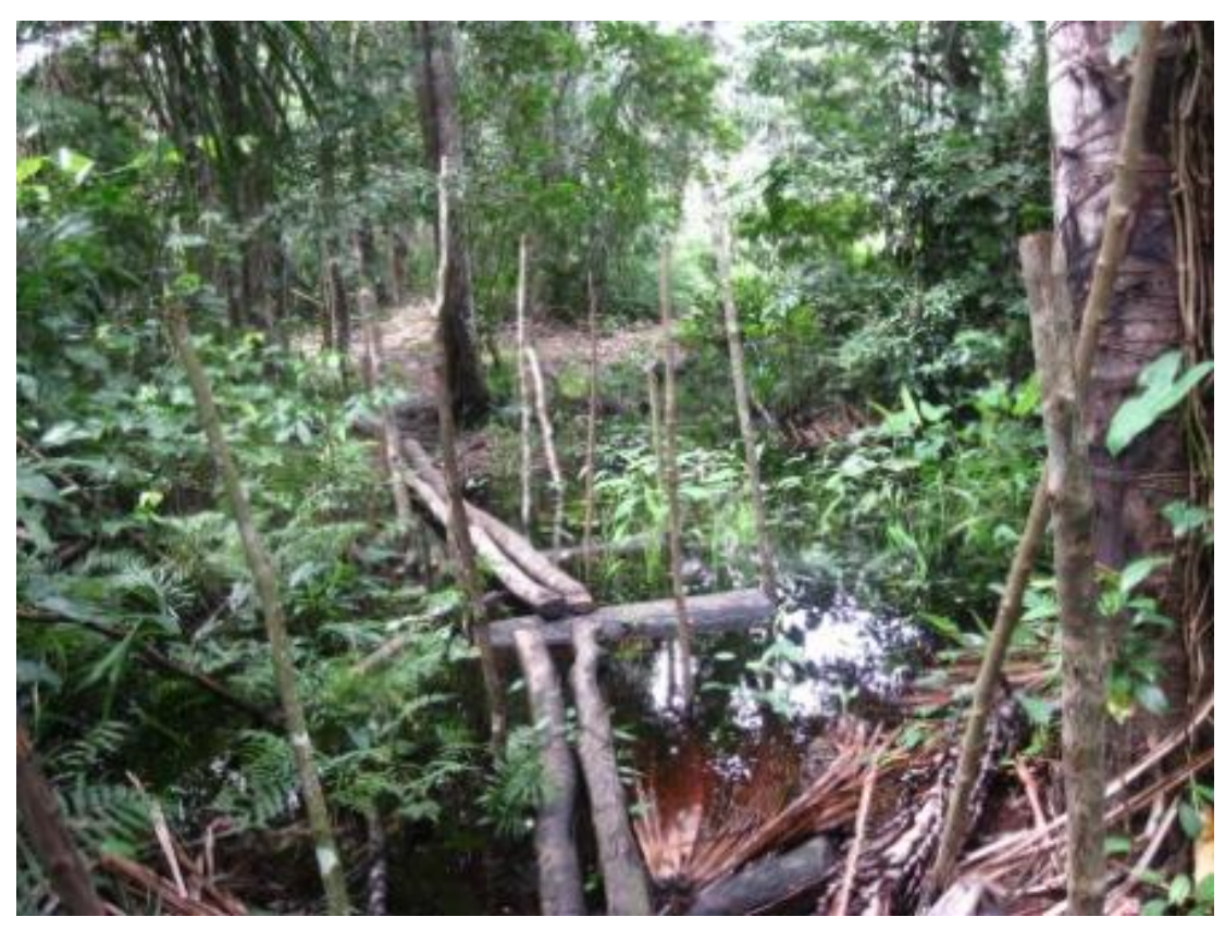
Part of the jungle trail through the biodiversity rich Arawone forest in Galibi.

efforts, an existing footpath was cleaned and broadened, small bridges across difficultly accessible or swampy areas were made, and on a strategic location a little park was made to rest and get information about the surroundings. The trail goes in a U-shape from Christiaankondre to Langamankondre, through the arawone forest. The establishment of the trail and park was agreed upon through the regular decision-making structures of the communities, including by village meetings and by the traditional leadership, after assurance that it will be managed by the local organization. The WWF-Guiana office in Suriname provided financial support, and the trail was inaugurated in October 2011.