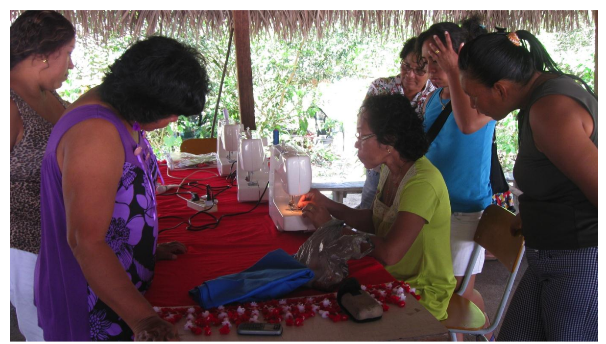
Project on economic empowerment of indigenous women from a rights-based and indigenous perspective.