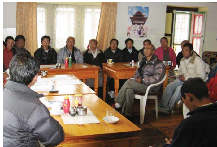
Figure 4. Sherpa leaders discussing their ICCAs in Khumjung village, Khumbu (Sagarmatha National Park Buffer Zone) in May, 2008.