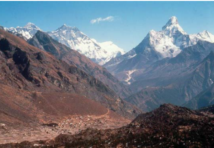
Figure 2. Part of the eastern area of the Sherpa homeland and beyul of Khumbu (Sagarmatha National Park) in 2001. Mt. Everest, the Sherpa sacred mountain Chomolungma, is at the upper left. In the foreground is the village of Khumjung with its sacred temple forest, community forest, and community-managed grasslands, which are all Sherpa ICCAs.

sacred forests, mountains, and lakes, red panda habitat protection areas, a sanctuary which protects ground-nesting birds, rotational grazing management systems, community forests where tree felling for timber and deadwood gathering for fuel are restricted or banned, and a region-wide firewood collection management system that has reduced firewood use by 75% since 2002. 57 While some of these ICCAs have been created over the past 8 years, others have been maintained for generations and even centuries. 58