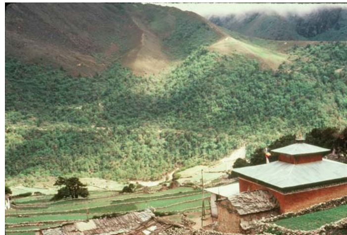
Figure 3. Pangboche village in Khumbu (Sagarmatha National Park Buffer Zone) and the Sherpa sacred lama's forest at Yarin (Sagarmatha National Park) in 2004. Sherpa oral traditions testify to strict protection of this forest from tree felling for four centuries. Sherpa protection of this ICCA continues today.

The Sherpa experience with attempting to gain recognition and respect for their ICCAs highlights how far Nepal has yet to go in honouring human and Indigenous peoples' rights in its national parks. The problem is arguably not the government officials' lack of awareness of Nepal's international obligations to honor Indigenous rights or of IUCN and CBD policies supporting rights-based conservation and ICCAs. 64 Many other factors may play a role, including lack of appropriate training, administrative capacity, and financial resources, the unstable national political situation,