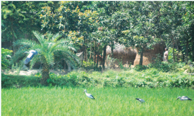
Asian Openbill at Shakhidar Para of Joypurhat in 2008

About seven acres of wood at Shakhidar Para Village (25001'07 N and 89002'07E) can be termed a potential CCA. About 700 Asian Openbills nest in the wood. In addition to bird nesting, there is a bat