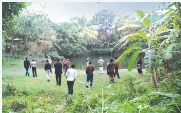
Visiting the CCA Site In Pochamaria, 2008

Pochamaria was turned into a heronry about a decade ago when a small flock of cormorants started roosting at first and then started breeding in the area later on. It is possibly the largest one in the country outside of government managed reserved forests. The heronry is supported by a few bamboo clumps within the compound of