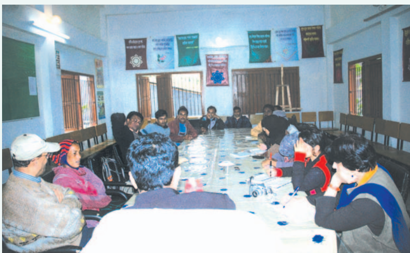
Kalpavriksh team and WTB arranged meeting with local people in Rajshahi, 2008

At one time the area of the VCF was more than 300 acres, but it has now been reduced to 200 acres. The present population is about 400 in 42 families. A few years ago they sold all the large trees for Taka 95000 ($ 1183). Later, due to conflict of interest 18 families claimed their due share and they were