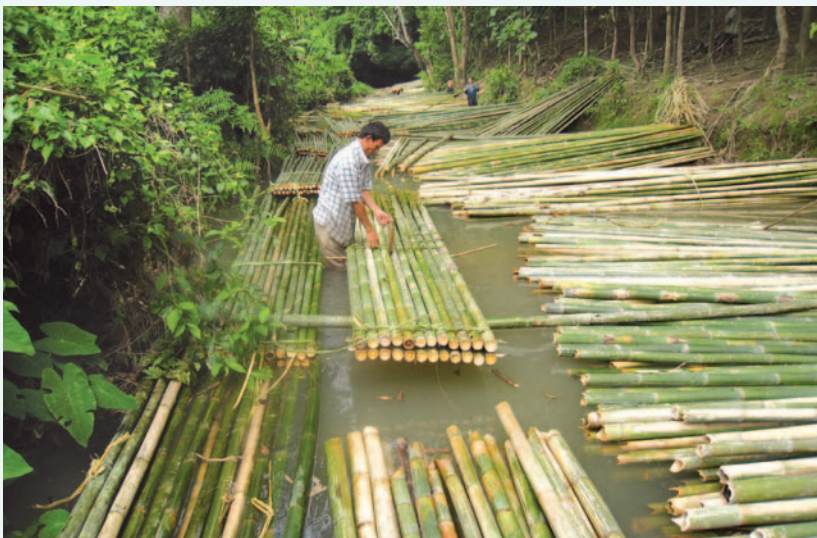
Harvesting bamboo at Baghchari of Rangamati district in 2008

A management committee headed by a karbari (village head) manages the VCF. The committee is principally guided by customary rules of the village. Harvesting of forest products from the VCF is allowed for community use such as construction of schools, temples, etc. but not for commercial use. Firewood and non-wood products such as bamboo are allowed to be harvested to meet the basic needs of the community. Sometimes timber extraction is allowed for building or repairing the houses with the consent of other stakeholders and the karbari . Those communities which are not permanently settled tend to over-exploit the VCFs, making these community forests unsustainable. The permanent settlers need to keep a small patch of forest adjacent to their jhum to secure the source of water and access to livelihood resources.