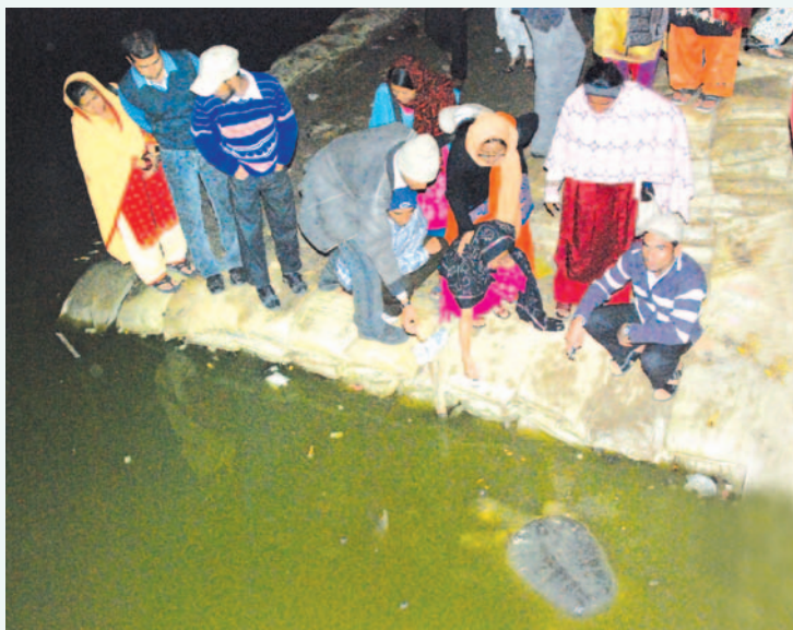
Pilgrims trying to feed Bostami turtle at midnight, 2009

The general belief is that the famous saint is lying buried in this shrine. Therefore, the whole area has been named after him and the road in front of it is called Bayazid Bostami Road. It is widely believed that these turtles were brought by the Saint. There is a strong belief that the turtles are descendants of the evil spirits whose ancestors having incurred the wrath of the great saint, were transformed into turtles. Later it was revealed that Sultan al-Arefin Byazid Bistami never visited and/or arrived in Chittagong. Historians say that it is an ' astana ' (sitting place) associated with the name of the great saint. In the 15th century there was a king in Bengal named Sultan Shihab al-Din Byazid Shah. Possibly it is his grave and his name might have been modified as Sultan Bayazid Bostami by some of his followers.