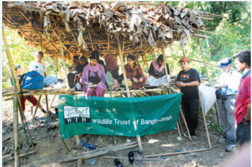
Small group meeting with local people (Kalpavriksh team visiting Baghchhari of Rangamati in Bangladesh), 2008