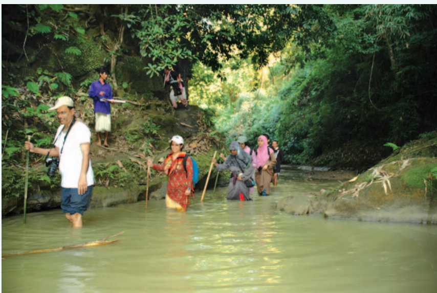
Kalpavriksh team joins WTB team to visit Baghchhari of Rangamati, 2008