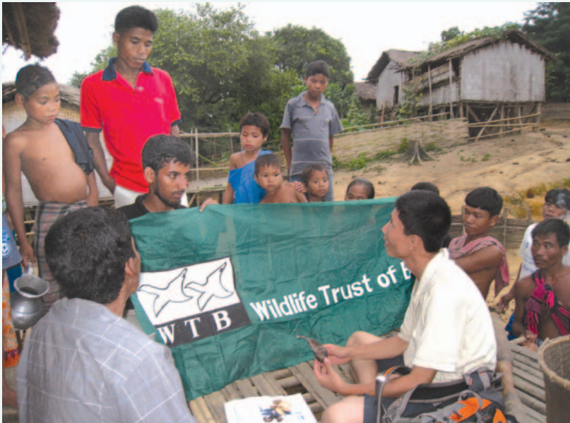
WTB team with the local people of Barkal in 2008