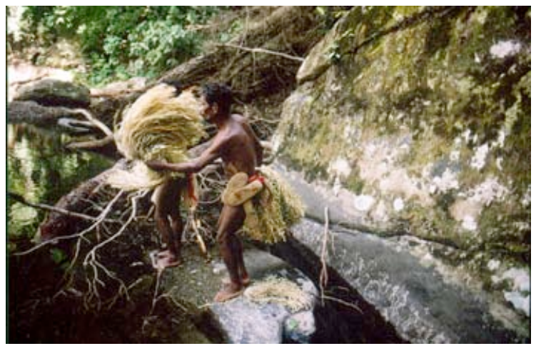
A Batak shaman performing the tarok dance

In this respect, their role as managers of natural resources is great of relevance. Certain wilds trees, such as the providers of pollen for the bees, the providers of resins and medicine, etc. as well as different animal species are believed to be under the control of mystical entities (panya'en). Such entities are