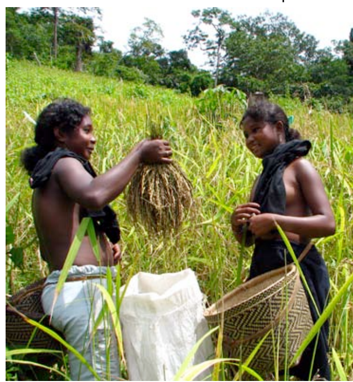
Batak girls harvesting upland rice

Contrary to the standard description of Batak as 'pure' hunters and gatherers the people do engage in upland farming. The Tanabag Batak have a very complex and detailed mythology dealing with rice and elaborated swidden rituals. Numerous legends trace the origin of rice way back to people's remote past. They name and recognise over 70 landraces of upland rice, of which 44 are said to be dati (old) and tunay (original) to the area. Fields, once cultivated, are left to fallow for several years and are then replanted with rice, root crops and vegetables. During the fallow cycle, nutrients are returned to the soil mainly as ashes from the burnt cover-crop forest. Batak know how to control and prevent fire from spreading form the burned fields to the surrounding forest. Planting techniques are also ecologically sound since the dibble stick does not disturb the fragile forest soil to more than a depth of a few centimeters. Batak fallow forest produces food resources that, generally, do