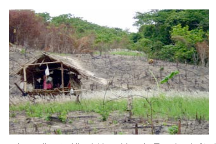
←A sample of short-fallow swidden

According to Ubad (the eldest in Tanabag): "today the people clear their swiddens again after 3/5 years, when trees have not even reached the size of a leg. When you burn them, little ashes are produced - not enough to make your rice healthy". In other words, because of culturally insensitive and ecologically unsound laws, the Batak can no longer respect long-rotations periods for the re-cultivation of their fields, this – in turn – have an impact on forest regeneration. Thus attempt should be made to inform the local government about the ecological advantages of clearing old-fallow fields rather than short-fallow fields. As of now, local authorities in Palawan have limited or no understanding of how fire and fallow periods contribute to the creation of highly diverse and biologically valuable ecosystems with thriving plant and animal species that could not survive in 'natural' forest (see Margalef 1968, Brosius 1981, Rai 1982).