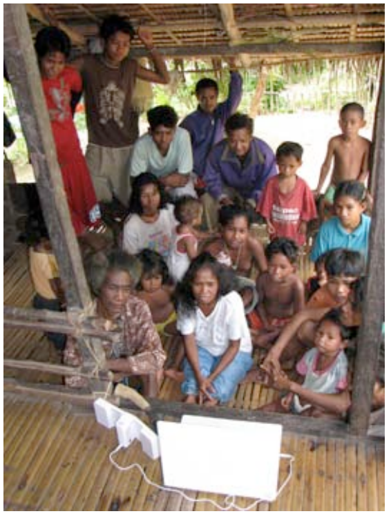
Batak watching at their digital archive

biocultural diversity both internally, as well as with environmental managers and policy makers. As of now, video-documentation of Batak ecological knowledge and practices has been generated in total coordination with the people themselves. In the project's second phase, additional efforts will be invested in developing capacities among the Tanabag to produce and edit their own video materials. Some young people have already shown a strong interest in learning these techniques and in producing their own videos. Overall, the video-documentation strives to give Batak families an improved information base on which to make critical decisions regarding key environmental and social issues within their CCA, as well as to conserve memories of the past. While the medium-long term impact of these family archives needs to be evaluated, the outcomes and experiences so far highlight a number of important aspects, such as an increasing sense of ownership and a regained sense of pride in 'being a Batak'.