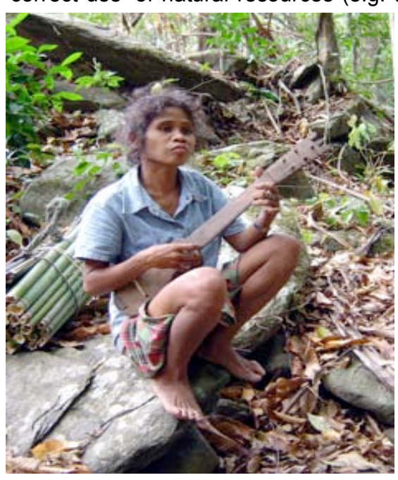
Playing the traditional five-strings guitar

products such as wood for charcoal making. This suggests that, under particular circumstances, the Batak might be forced to contravene their own sustainable patterns of NTFPs extraction, as well as those 'customary norms' associated with a 'correct use' of natural resources (e.g. the maintenance of good relationships with