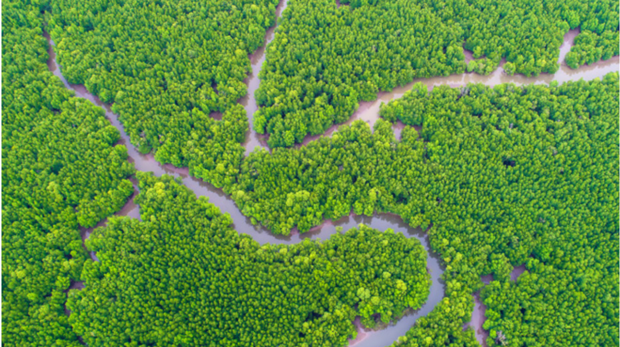
Aerial view of mangrove forest and river

emissions in Bolivia, Brazil, and Colombia 39 . An analysis in Brazil comparing indigenous areas to protected areas (and sustainable-use areas) found indigenous areas achieved the greatest avoided deforestation while facing the highest levels of deforestation pressures 40 .