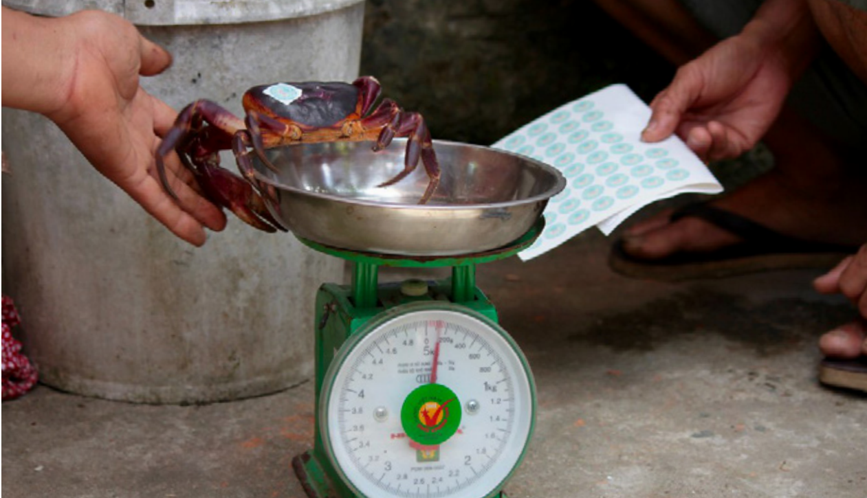
The Small Grants Programme Vietnam