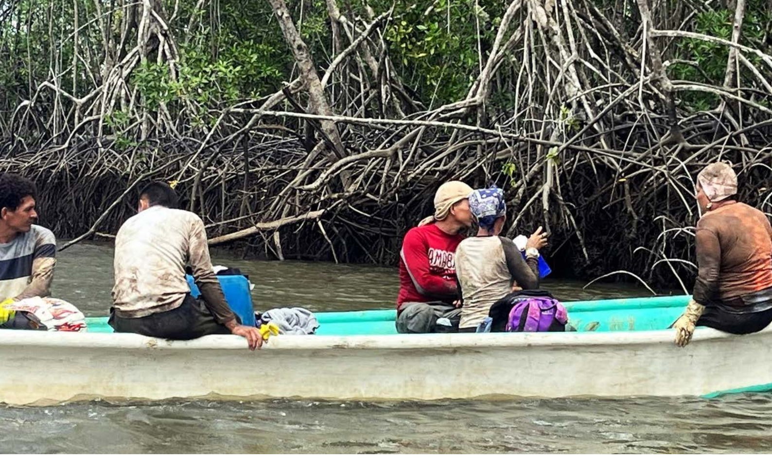
Marine territory of life in Manglar de Térraba Sierpe, South Pacific, Costa Rica.