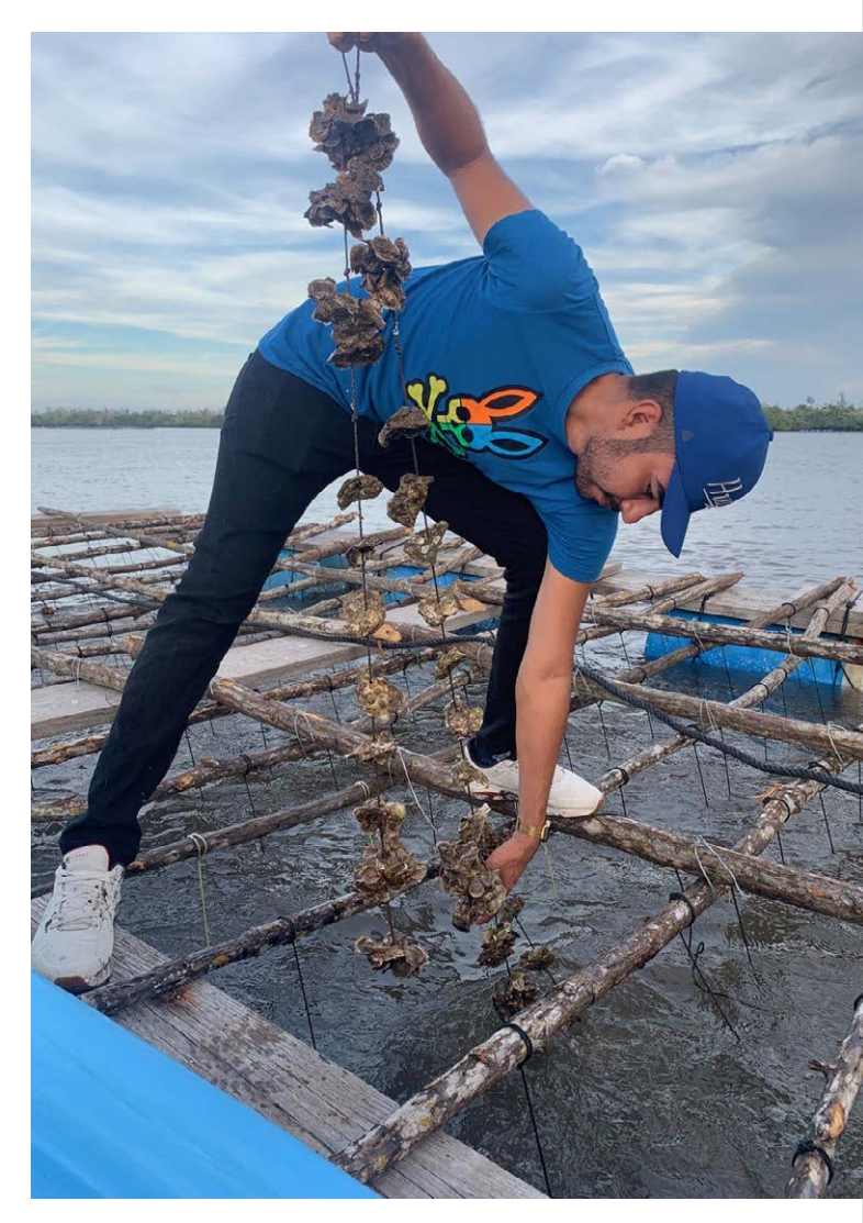
Marine territory of life in Bocas de Camichín, Nayarit, México.

Yes, the convention was ratified by Mexico in September 1990.