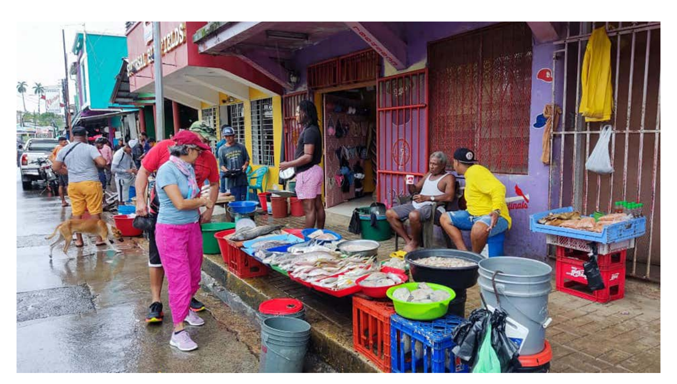
Artisanal and community fishing territory of life and market in Bluefields, Nicaragua.

The Fisheries and Aquaculture Act No. 489 of 2004 includes broad references to the artisanal sector. Firstly, it indicates that Nicaraguan nationals carry out small-scale fishing with vessels of up to 15 meters in length and must obtain their respective fishing permits. It also recognizes fishing for subsistence or personal consumption. Such fishing is to be carried out by