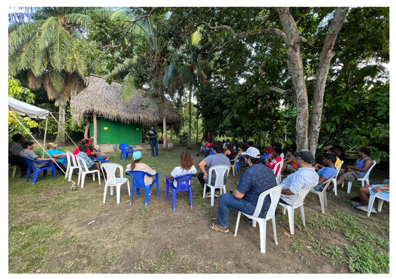
Marine territory of life in Porvenir, Atlántida, Honduras.

Honduran legislation does not have gender provisions regarding fisheries, and youth are not recognized for their role in the development of small-scale fishing activities.