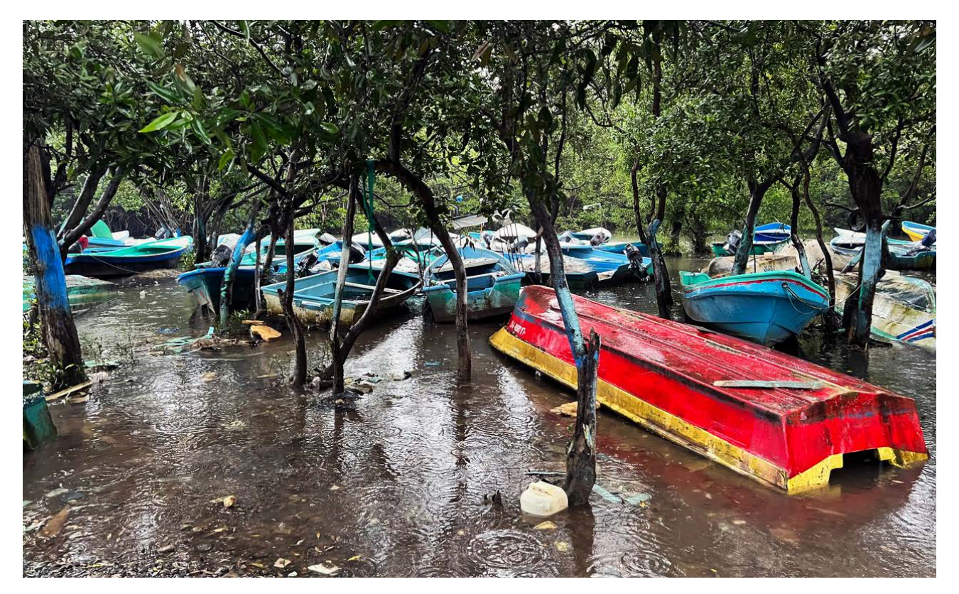
Chomes marine territory of life, Central Pacific, Costa Rica