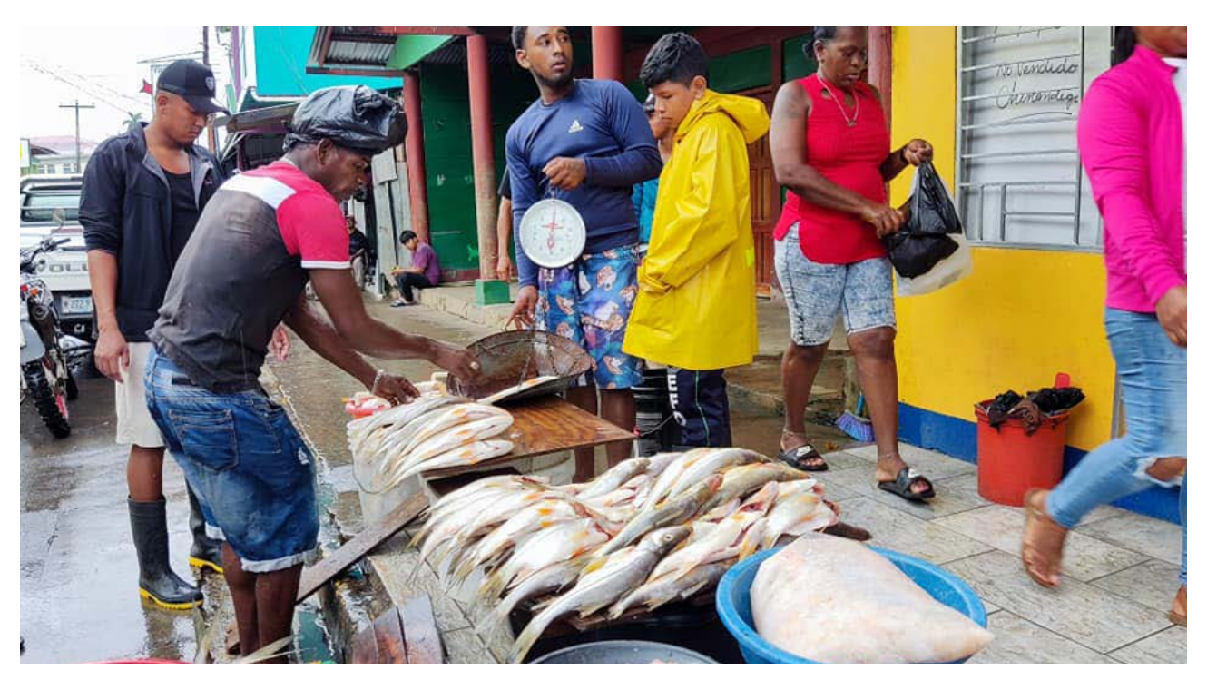
Artisanal and community fishing territory of life and market in Bluefields, Nicaragua.

Neither the Fisheries and Aquaculture Act No. 489 nor its regulations include provisions related to a gender perspective on the small-scale fisheries sector. Nor are there any regulations that consider young people in small-scale fisheries.