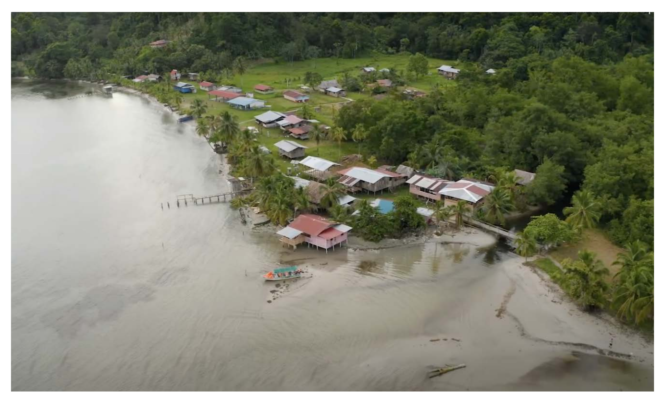
Marine territory of life in Ngäbe Buglé, Panamá.

Fishery regulation in Panama refers to the gender perspective when implementing and developing a fishery management plan. However, it does not include provisions recognizing young people's contribution to developing small-scale fisheries.