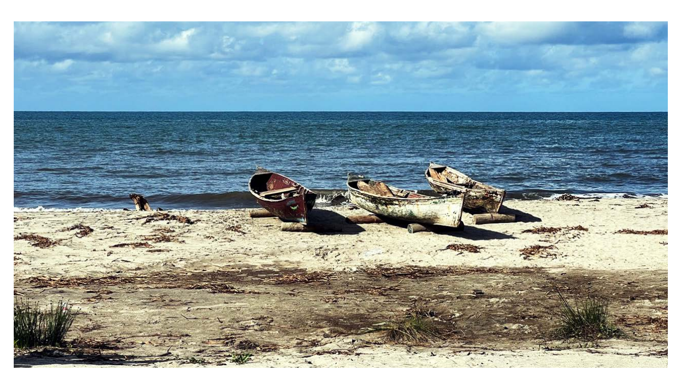
Garífuna marine territory of life in Sambo Creek, Honduras.

Decree No. 106-215 of the General Law on Fisheries and Aquaculture considers small-scale fishing, which is defined as a fishing activity that is carried out in coastal strips in small vessels without navigation facilities, applying low-technology fishing methods and implements, and which can be subdivided into basic and advanced artisanal fishing. On the other hand, this law also recognizes responsible fishing, which is carried out under conditions that guarantee the sustainable use of fisheries resources and do not harm ecosystems and the quality of the products derived from them. The legislation provides a general definition of aquaculture but does not recognize different categories and provisions.