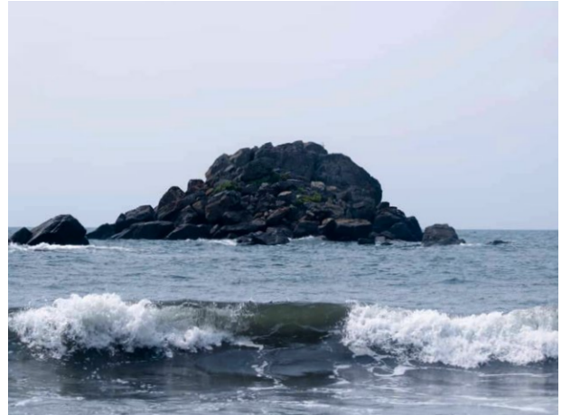
The sacred rock, "Rocher du Loup."

At its heart lies a rocky outcrop considered by the community to be the core of the ICCA, because of its religious and spiritual significance. According to community initiates, this rock, once nestled within the