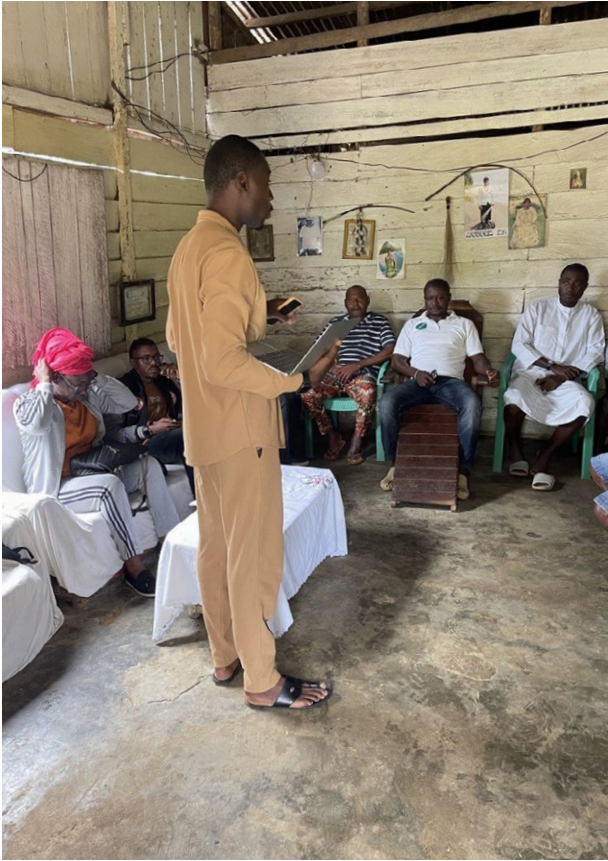
Community meeting in Bouandjo village