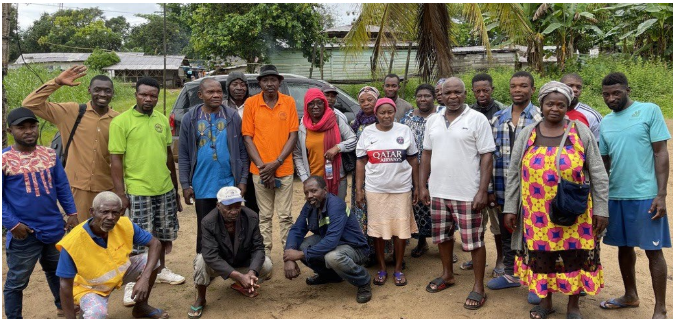
Community of Campo-Beach

In Cameroon, ICCAs—territories of life are areas and territories governed, managed, and conserved by Indigenous Peoples and local communities. These territories are characterized by enduring cultural, spiritual, and livelihood relationships between communities and their environments. Their recognition